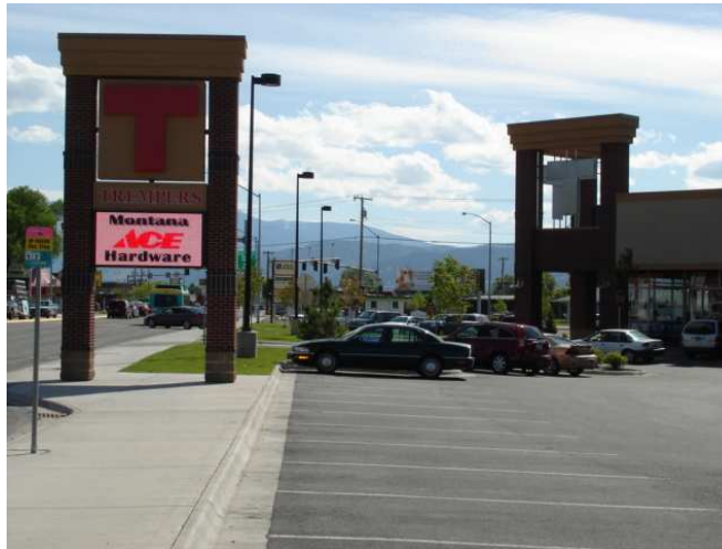
Tremper's, one of the first 2007 projects to be completed, fronts a long list of redevelopment projects. The new look has made a terrific impact for the future of Midtown Missoula.

The agenda will include updates on recent and future development projects, re-development activities, traffic control, and regional happenings. Additionally, there will be discussion regarding the development of 2008's goals and objectives, formation of committees and information about Board elections for the coming year.